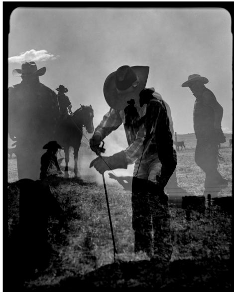
IAN MARKUS. Matador 02 , 2024, 20 x 16, gelatin silver print, unique

A photographic exploration into the fading culture of ranching.