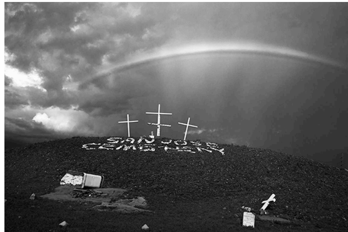
ROGER DEAKINS. The passing storm, Albuquerque, 2014

Included in the Obscura Gallery exhibition are a selection of images from the monograph Byways , now in its seventh reprint, which includes over 150 previously unpublished black-and-white photographs spanning five decades, from 1971 to the present. After graduating from college Deakins spent a year photographing life in rural North Devon, in South West England, on a commission for the Beaford Arts Centre; these images are gathered here for the first time and attest to a keenly ironic English sensibility, also documenting a vanished postwar Britain. A second suite of images expresses Deakins' love of the seaside. Traveling for his cinematic work has allowed Deakins to photograph landscapes all over the world; in this third group of images, that same irony remains evident. There are several images in the exhibition taken in our home-state of New Mexico with the same character and signature style of which Deakins is revered.