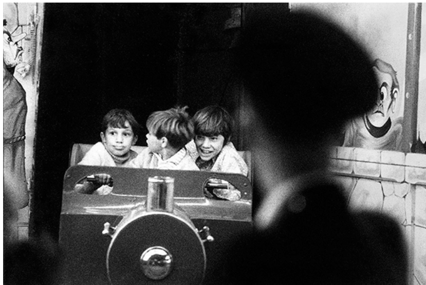
ROGER DEAKINS. The ghost train, Barnstaple, 1971

Roger A. Deakins was born and raised in Devon. He studied Graphic Design at the Bath College of Art and before continuing on to the National Film School, he spent time shooting still photographs for North Devon, with the intent of capturing the disappearing rural farm life. Here he developed his love of still photography. After graduating from the National Film School, he shot a number of documentaries and then moved into feature films.