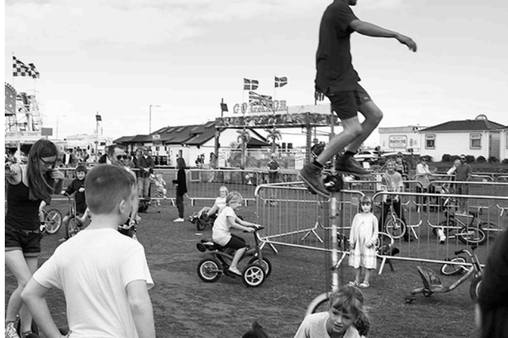
ROGER DEAKINS. Little girl marooned, Paignton, 2015