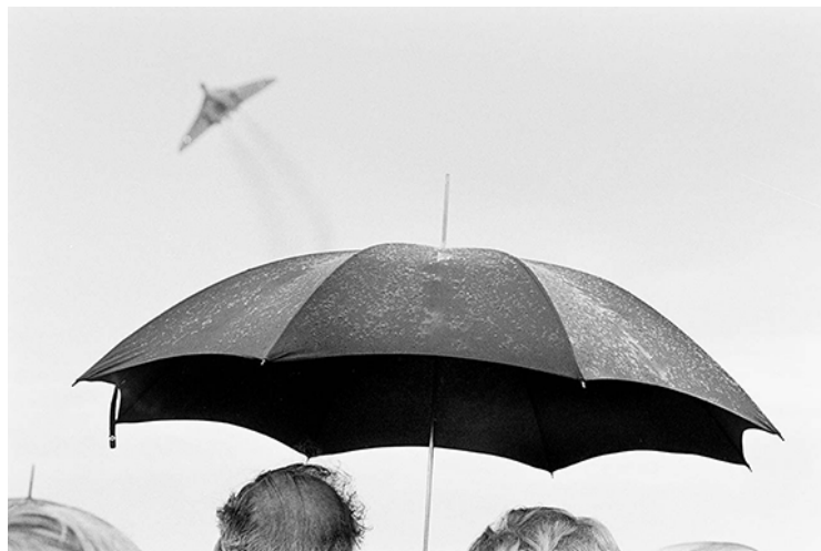
ROGER DEAKINS. The Takeoff Chivenor Air Show, 1971