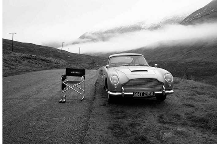
ROGER DEAKINS. Judis chair, Scotland, 2012

Included in the Obscura Gallery exhibition are a selection of images from the monograph Byways , now in its seventh reprint, which includes over 150 previously unpublished black-and-white photographs spanning five decades, from 1971 to the present. After graduating from college Deakins spent a year photographing life in rural North Devon, in South West England, on a commission for the Beaford Arts Centre; these images are gathered here for the first time and attest to a keenly ironic English sensibility, also documenting a vanished postwar Britain. A second suite of images expresses Deakins' love of the seaside. Traveling for his cinematic work has allowed Deakins to photograph landscapes all over the world; in this third group of images, that same irony remains evident. There are several images in the exhibition taken in our home-state of New Mexico with the same character and signature style of which Deakins is revered.