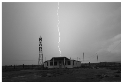
Lightning Strikes, New Mexico 2014