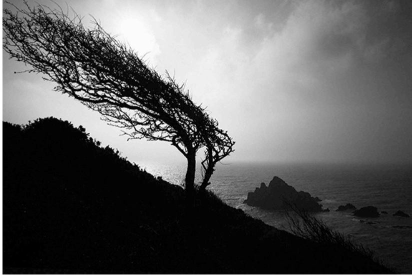
ROGER DEAKINS. The Wind Blown Tree, Dartmouth, 2015

Roger A. Deakins was born and raised in Devon. He studied Graphic Design at the Bath College of Art and before continuing on to the National Film School, he spent time shooting still photographs for North Devon, with the intent of capturing the disappearing rural farm life. Here he developed his love of still photography. After graduating from the National Film School, he shot a number of documentaries and then moved into feature films.