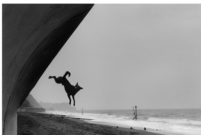
The Joy of Flight, Teignmouth, 2000

A photographic exhibition reflecting a life spent looking and telling stories through images from 1971 to the present.