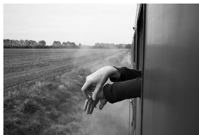
Smoking Break, Germany, 2007