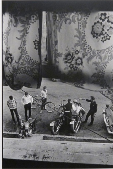
DANNY LYON. From Lindsey's Room, Louisville KY, 1966, 8.5 x 13", gelatin silver print.

In addition, Lyon became internationally known through his photographs of the Civil Rights Movement and the Chicago Outlaw Motorcycle Club. The latter culminated in his seminal book, The Bikeriders , a landmark of modern photojournalism that collected interviews and photographs, documenting the abandon and risk implied in the name of the Chicago Outlaw Motorcycle Club. A feature-length film by Jeff Nichols, The Bikeriders , is based on Lyon's book of the same name and will be released in December 2023.