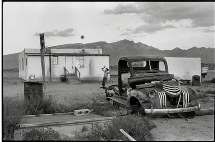
DANNY LYON. Llanito, New Mexico, 1970, 8.5 x 13" , gelatin silver print.

A long-time resident of Bernalillo, New Mexico, Lyon has spent decades photographing his friends, family, and neighbors, creating a reverent and empathetic portrait of the community.