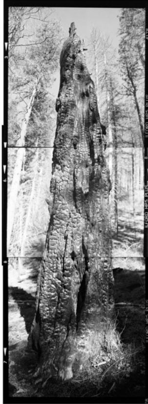
DANNY LYON. Remains of a ponderosa pine destroyed in the Los Conchas fire, New Mexico. 2014, 40.25 x 14.75", gelatin silver print.

Lyon's more recent work explores southwest landscapes and the environment, documenting the impacts of extreme drought and fire on the land. Bleak but beautiful scenes of burnt forests show our new climate reality. Montages portray the vastness of the southwest landscape and the passage of geological time.