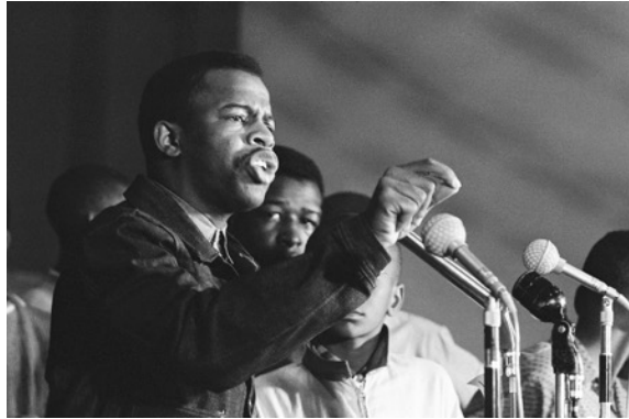
DANNY LYON. Portrait of John Lewis, Age 24, Chairman of the Student Nonviolent Coordinating Committee, MI, 1964, 9 x 13", gelatin silver print.

In 1962, Lyon was hired as a photographer for the Student Nonviolent Coordinating Committee (SNCC) and spent years immersed in the movement, documenting sit-ins, arrests, speeches, marches, and the great leaders driving the movement for freedom for Black Americans. Lyon documented major figures, including civil rights leader John Lewis, while also photographing and getting to know people who are often overlooked.