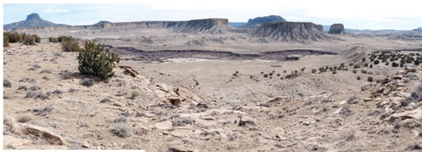
DANNY LYON, The Rio Puerco Seen from South of Cabezon, New Mexico, 2019, 6.25 x 18", archival pigment ink print.

Lyon's more recent work explores southwest landscapes and the environment, documenting the impacts of extreme drought and fire on the land. Bleak but beautiful scenes of burnt forests show our new climate reality. Montages portray the vastness of the southwest landscape and the passage of geological time.