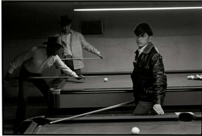
DANNY LYON. Navajo Pool Room, Gallup, New Mexico, 1970, 8.75 x 12.75" , gelatin silver print.

A long-time resident of Bernalillo, New Mexico, Lyon has spent decades photographing his friends, family, and neighbors, creating a reverent and empathetic portrait of the community.