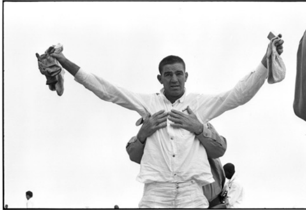
DANNY LYON, Shakedown, Ellis Unit, Texas, 1968, 12.5 x 18.5" , gelatin silver print.

Many of Lyon's portraits are based on the complex stories of the portrayed individuals. He spent time getting to know the people he photographed, hearing their stories and their struggles, and often maintaining friendships for many years. Lyon spent two years documenting the treatment of inmates in the Texas penitentiary system. Photographs of prisoners on chain gangs working in the fields, unconscious from heat exhaustion, and stripped bare for shakedown searches all present pointed commentary on mass incarceration photographing the Texas prison system.