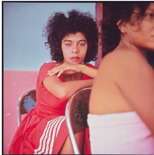
DANNY LYON, Tesca, Cartagena, Colombia , 1966, 10 x 10", Cibachrome.

Danny Lyon is internationally recognized as a major force in establishing new models for both documentary photography and the photography book. He has won numerous honors and awards in both photography and film, including Guggenheim Fellowships in both film and photography, and the 2015 Lucie Award for Achievement in Documentary Photography. Over the course of his career, he has published more than 20 books of photography and has been the subject of over fifty solo exhibitions. Lyon's work is in the permanent collections of The Museum of Modern Art, The Metropolitan Museum of Art, the Whitney Museum of American Art, the Art Institute of Chicago, American Museum of Art, Smithsonian Institute, the J. Paul Getty Museum, and many other public institutions.