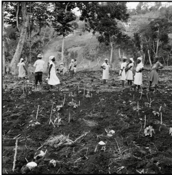
DANNY LYON, Women Wait to Plant a Field above Jacmel, Haiti, 1983, 15 x 15" , gelatin silver print.

Many of Lyon's portraits are based on the complex stories of the portrayed individuals. He spent time getting to know the people he photographed, hearing their stories and their struggles, and often maintaining friendships for many years. Lyon spent two years documenting the treatment of inmates in the Texas penitentiary system. Photographs of prisoners on chain gangs working in the fields, unconscious from heat exhaustion, and stripped bare for shakedown searches all present pointed commentary on mass incarceration photographing the Texas prison system.