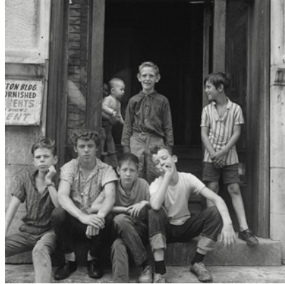
DANNY LYON, Uptown, Chicago , 1965, 7 x 7", gelatin silver print.

Danny Lyon is internationally recognized as a major force in establishing new models for both documentary photography and the photography book. He has won numerous honors and awards in both photography and film, including Guggenheim Fellowships in both film and photography, and the 2015 Lucie Award for Achievement in Documentary Photography. Over the course of his career, he has published more than 20 books of photography and has been the subject of over fifty solo exhibitions. Lyon's work is in the permanent collections of The Museum of Modern Art, The Metropolitan Museum of Art, the Whitney Museum of American Art, the Art Institute of Chicago, American Museum of Art, Smithsonian Institute, the J. Paul Getty Museum, and many other public institutions.