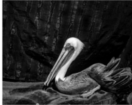
Nigel, Livingston, Louisiana, 2019