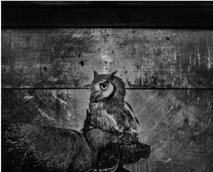
DEBBIE FLEMING CAFFERY, Northern White-Faced Owl, France, 2019 , 17.25 x 21.75", gelatin silver print, edition of 5.