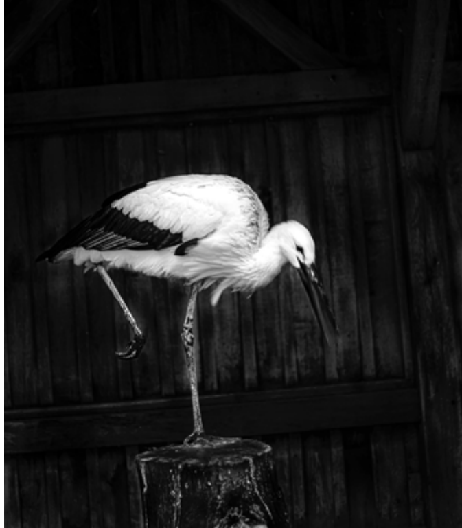
DEBBIE FLEMING CAFFERY, Stork, France, 2019 , 21.75 x 17.25", gelatin silver print, edition of 5.