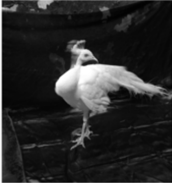
White Peacock, New Mexico, 1996