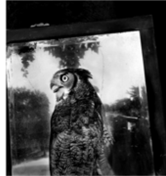
Bubba, Rio Rancho, New Mexico, 2019

Reception with the Artist: Friday, July 7, 2023, 5-7pm