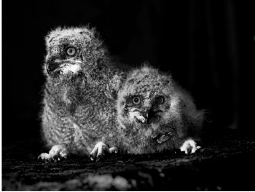
DEBBIE FLEMING CAFFERY, Baby Eagle Owls, France, 2022 , 16.25 x 21 3/4", gelatin silver print, edition of 5.