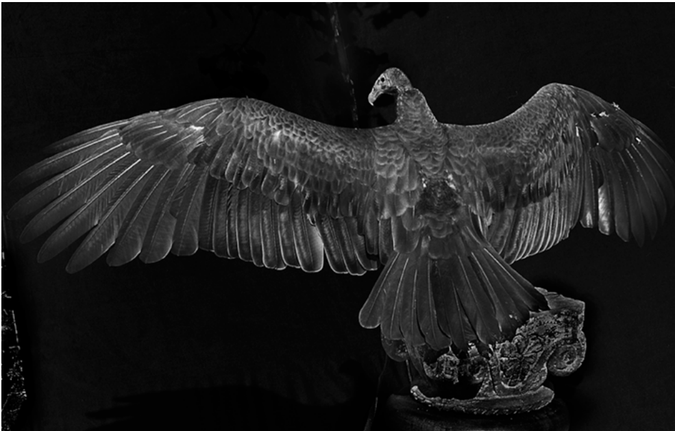
DEBBIE FLEMING CAFFERY, Beauty, Turkey Vulture, Corrales, New Mexico, 2018, 17.25 x 21.75" , gelatin silver print, edition of 5.

1405 Paseo de Peralta, Santa Fe, New Mexico 87505 obscuragalleryphoto@gmail.com