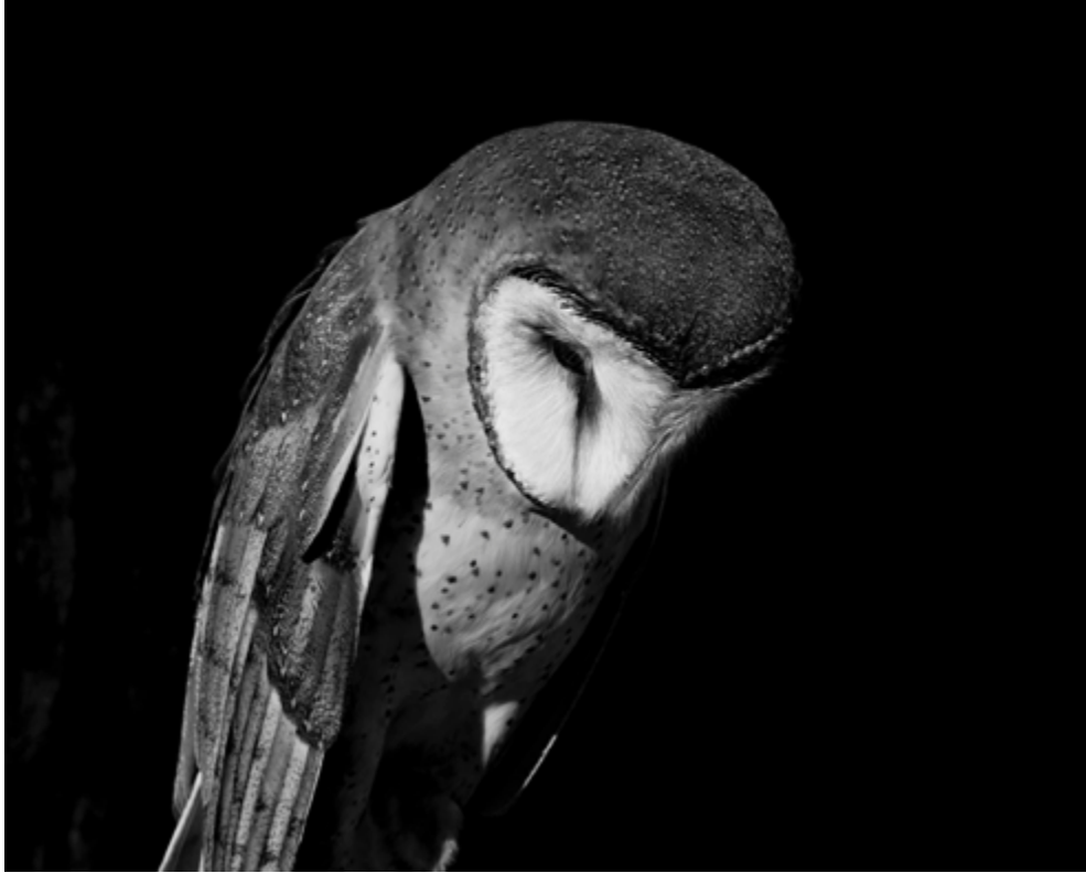
DEBBIE FLEMING CAFFERY, Celeste, Rio Rancho, New Mexico, 2018, 21.75 x 17.25" , gelatin silver print, edition of 5.

DEBBIE FLEMING CAFFERY, Eagle Owl, France, 2022, 17 3/4 x 21 3/4" , gelatin silver print, edition of 5.